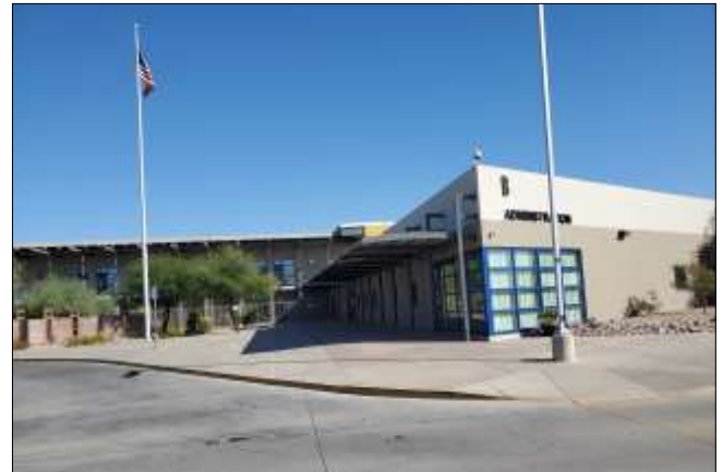
Casa Grande Union High School cghs.cguhsd.org

Set your computer homepage to your high school and stay up-to-date on all the activities and news!