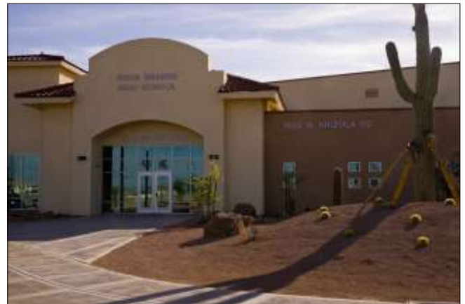
Vista Grande High School vghs.cguhsd.org